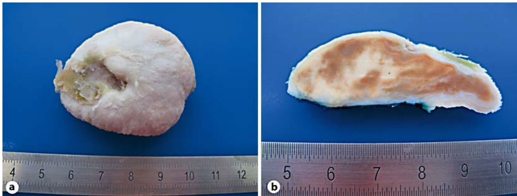
Fig. 2. a Large polypoid and ulcerated cutaneous mass excised from the patient's leg. b On cut section, it is found to be solid with brown and white areas.