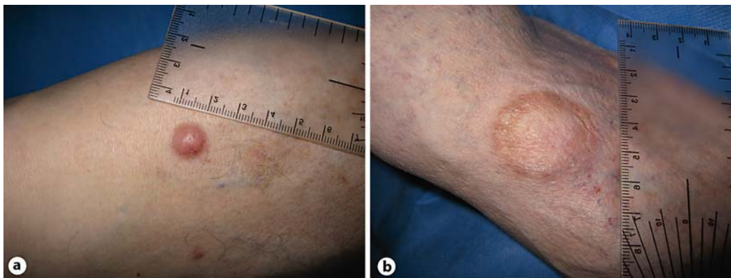
Fig. 1. a Small reddish cutaneous nodule on the right leg, consistent with DF. b Appearance of the scar 1.5 years after surgery.

In conclusion, we report another rare and interesting variant of giant DF, which is extremely difficult to diagnose clinically but not histologically, with an excellent clinical outcome.